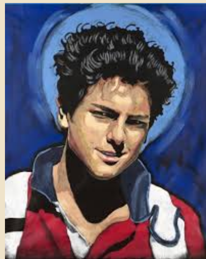
Canonization of Bl. Carlo Acutis - September 7