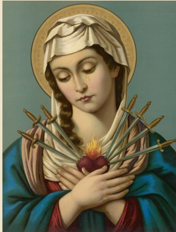
Our Lady of Sorrows - September 15